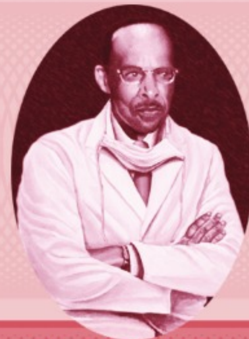
Vivien T. Thomas 1910-1985