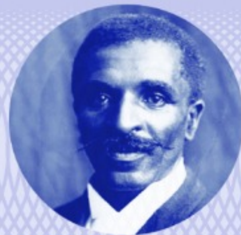
George Washington Carver 1864-1943